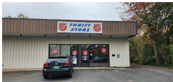
Salvation Army Thrift Store, 7 Martin Drive, W. Lebanon, NH