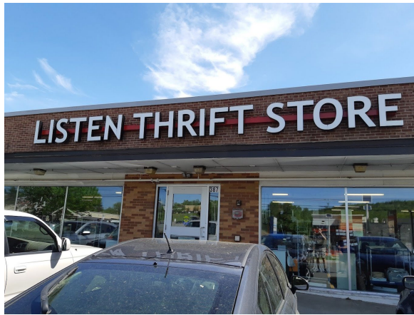
Listen Thrift Store 387 Miracle Mile, Lebanon, NH