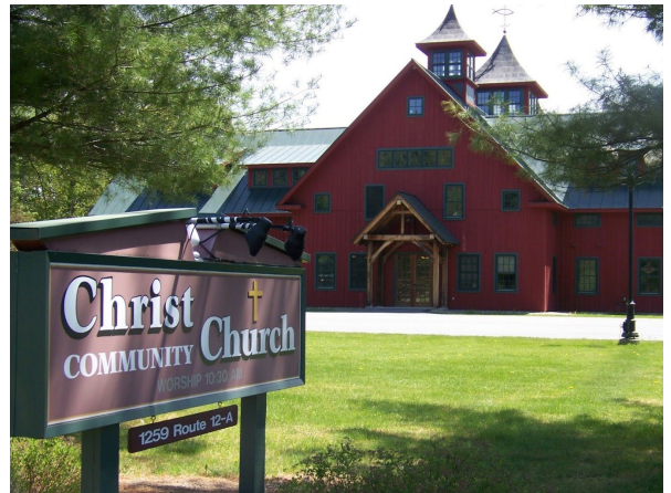
Plainfield Christ Community Church, 1259 Rte. 12A, Plainfield, NH