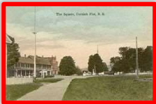
Flag poles in Cornish Flat, NH